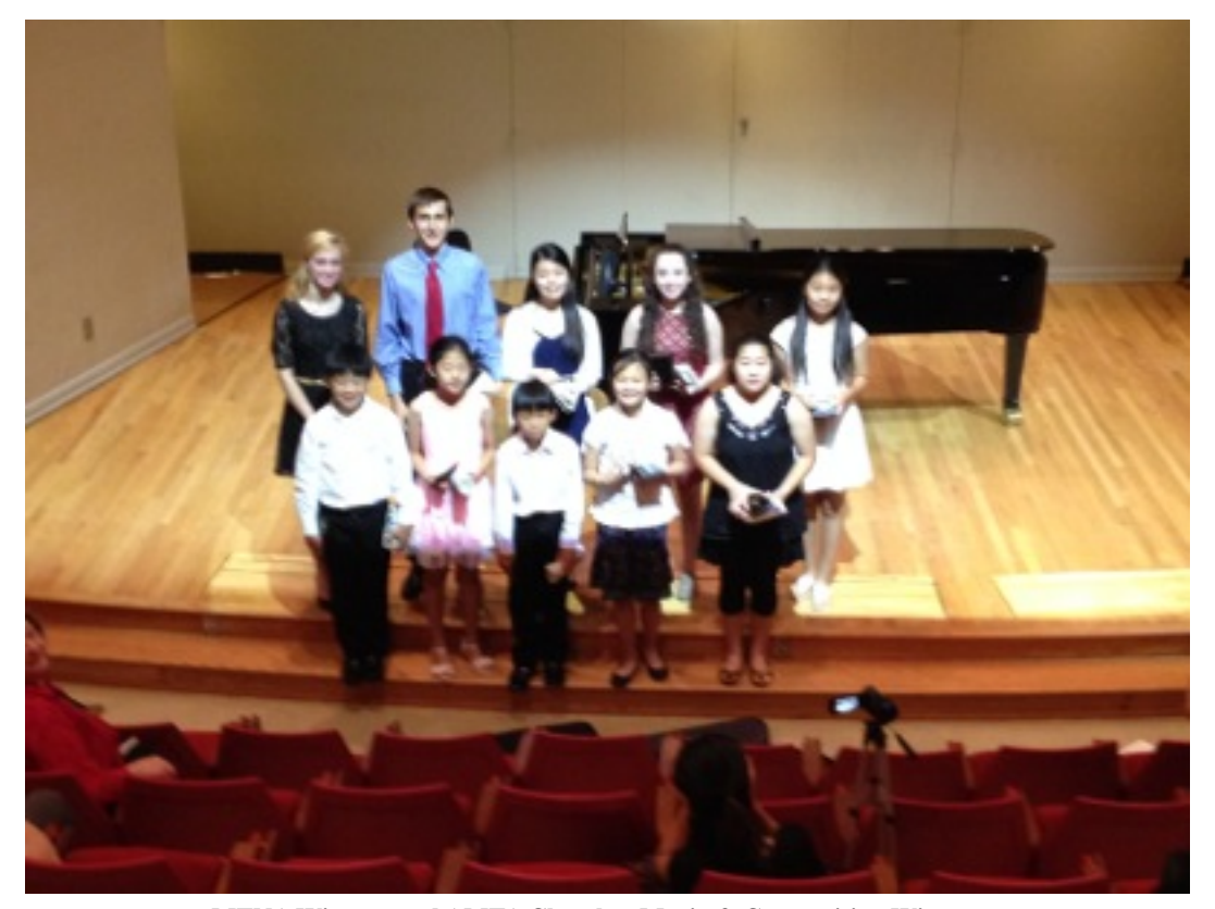
MTNA Winners and AMTA Chamber Music & Composition Winners