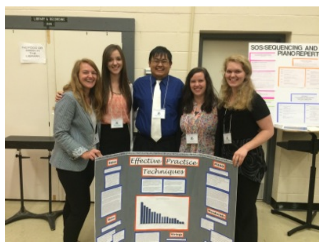
Auburn University Collegiate Chapter, 2015 Poster Presentation Winner