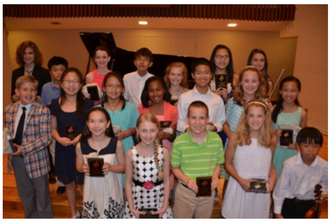
Division I Winner's Recital