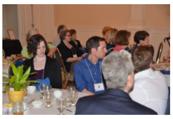
Enjoying the conference banquet