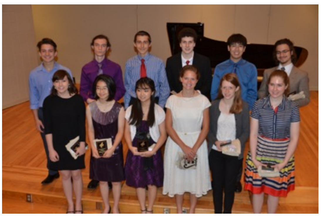
Division III Winner's Recital