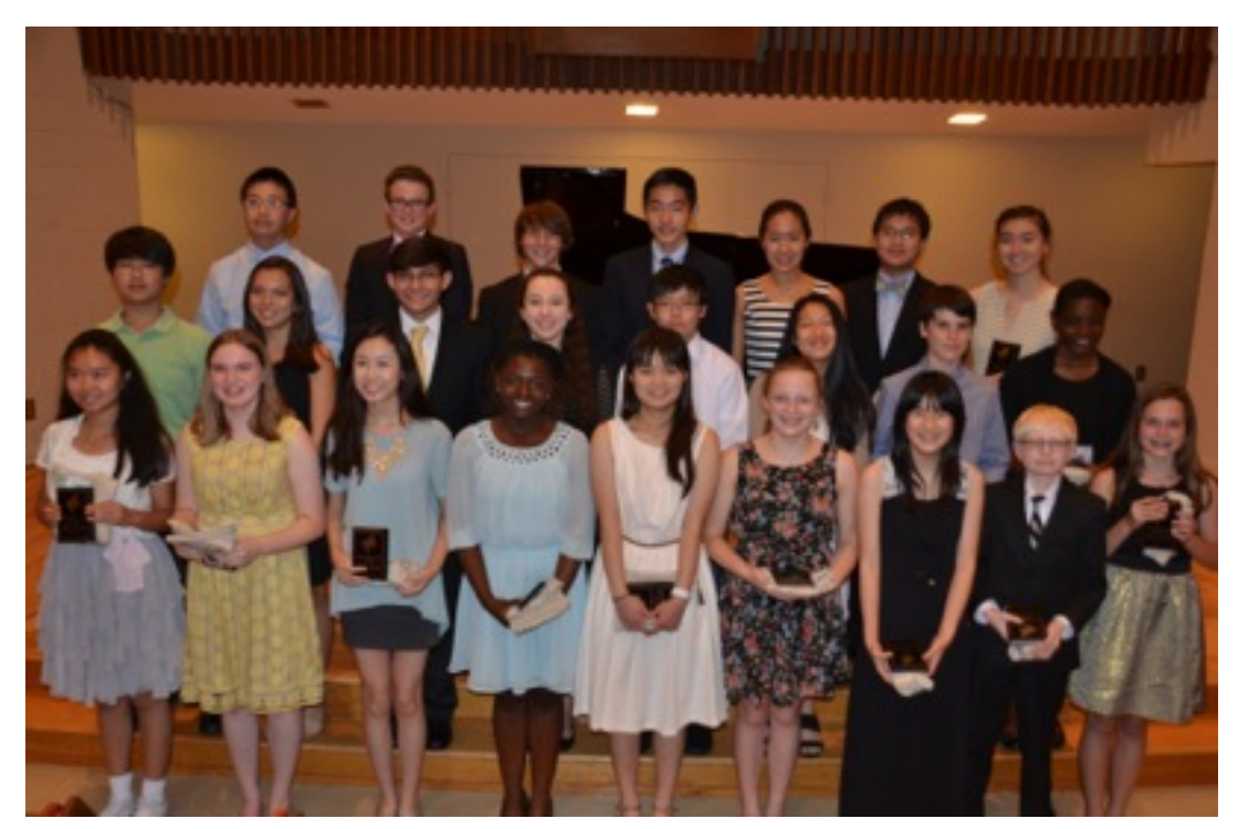
Division II Winner's Recital